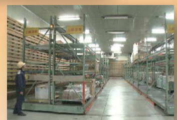
The door and inside of the +5°C refrigerator at A-Wing.