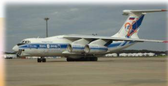
Volga-Dnepr Airlines' IL76TD-90VD

Once the loading operation was completed and after a long stay, the aircraft departed safely to Vladivostok Airport at night time.