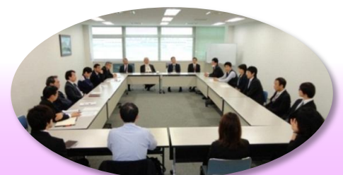
Temporary transfer employees and IACT board members.

national Airport Corporation (NAA), Nippon Automated Cargo and Port Consolidated System, Inc.(NACCS), to name a few. Presently there are 18 employees working at these companies (currently 10 companies in total), and some of these workers returned to the company and reported their work situations and shared their opinion with others.