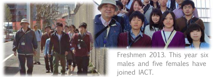
Walking around the airport.