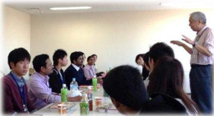
At IACT Narita Logistics Center, freshmen and IBS staff had lunch together.

Overall the initiation served as a re-affirmation for the new recruits to fulfill their role as working members of the society as well as representing new ideas that our company seeks in order to provide high quality services to our customers.