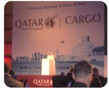
Mr. Akbar Al Baker, the Qatar Airways CEO gave a speech at the first day of symposium.

The new cargo facility at the airport covers more than 290,000 m 2 and is capable of handling 1.4 million tonnage of cargo per year. Expectations for Qatar Airways' bigger success in the future are quite high because Doha will establish its position as freighter hub linking the Eastern and the Western countries with the new airport and its state-of-art cargo terminal. We are very proud of providing our services to the world's leading airlines at Narita, Japan.