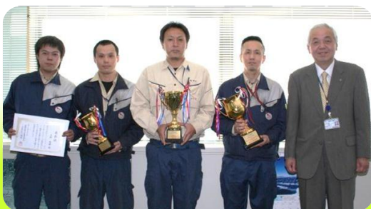
The "IACT team" members at the ceremony.